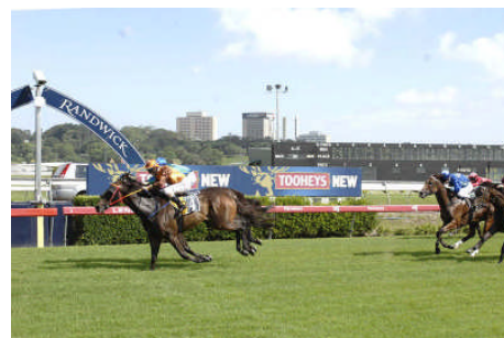
Universal Boy salutes at Randwick