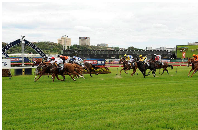
Onthelookout winning at Randwick

Follow The Command ended the month with a brilliant all-the-way win in the Benchmark 65 Handicap over 1400 metres at Parkes.